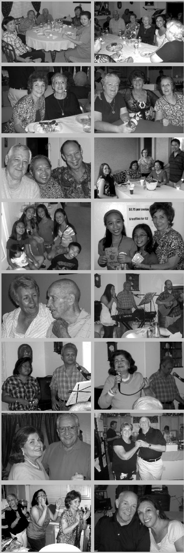
Photos From Chandler Potluck Barbecue Fund Raiser